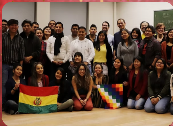
Gathering 1, 2019 - Brussels, Belgium