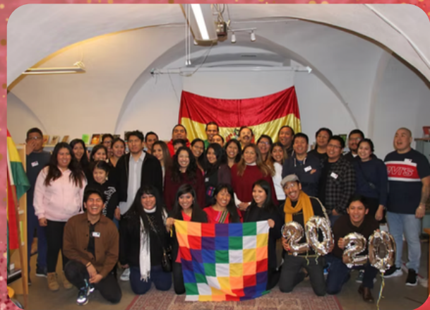
Gathering 2, 2020 - Stockholm, Sweden