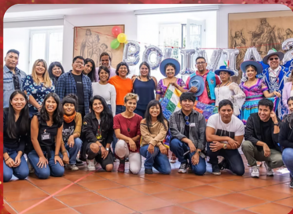
Gathering 3, 2022 - Bergamo, Italy